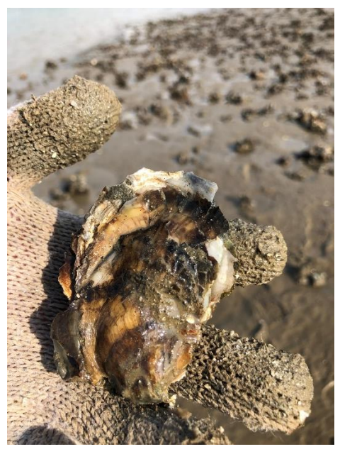
Image 3: Measuring the growth of oysters on restored reefs is key to understanding restoration success. Photo from Hong Kong.