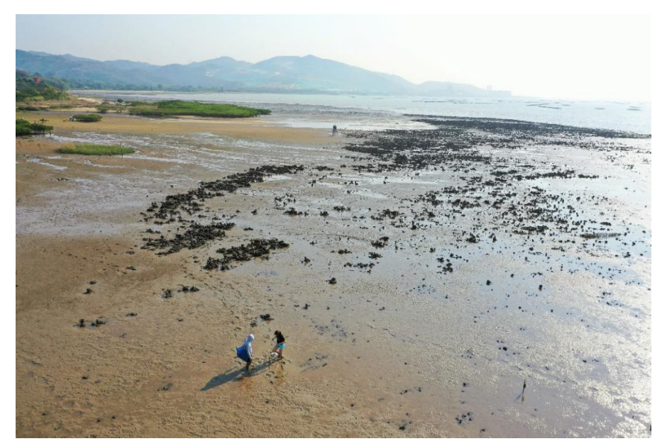
Image 1: Members of the research team doing biodiversity surveys of oyster habitat and the surrounding areas in Pak Nai, Hong Kong.

Global assessments of historical oyster reef distribution have estimated that over 85% of oyster reefs have been lost to overfishing and coastal development. In recent decades, enormous effort has been put into developing and implementing different methods for restoring oyster reefs globally. However, the overall effectiveness of these efforts has remained uncertain because of a lack of assessment of how long it takes for restored oyster reefs to begin to support marine biodiversity and provide ecosystem services to the same level of undamaged reefs.